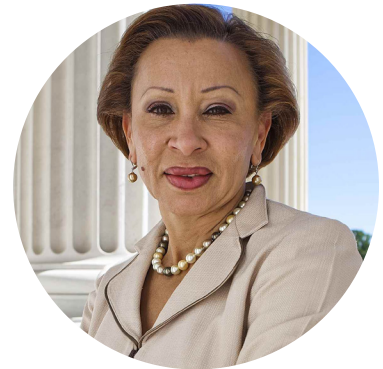
Congresswoman Nydia M. Velazquez

Nydia M. Velazquez represents New York’s 7th district in Congress and serves on the House Small Business Committee. She introduced the Main Street Employee Ownership Act (H.R.5236), which gives the SBA the tools and authority it needs to support small businesses in transitioning to employee ownership and which became law in August 2018. In 2022, seeing limited progress, she then co-sponsored two new bills to increase its impact. The framework of these policies should be studied and built upon by other national, state and local policymakers who are interested in eliminating access to capital barriers plaguing Black business owners who might otherwise embrace employee ownership.